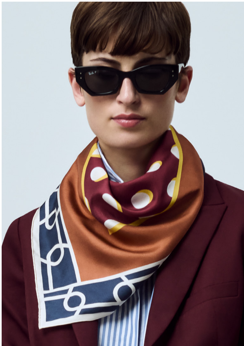
John Lewis Striped Shirt, Blue, £49 Tencel SB Blazer, Burgundy, £99 Large Trousers, Camel, £79 Polka Dot Large Silk Scarf, Burgundy/Multi £65 Ray-Ban Sunglasses, £130