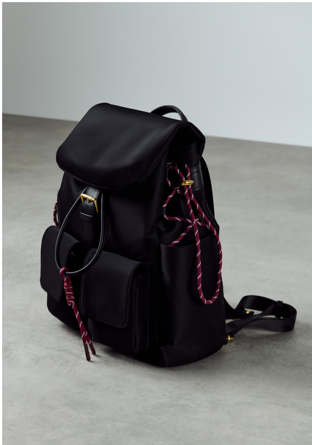
John Lewis Haze Elasticated Scrunchy Top Line Ballerina, Green, £69 Sage Backpack, Black, £79