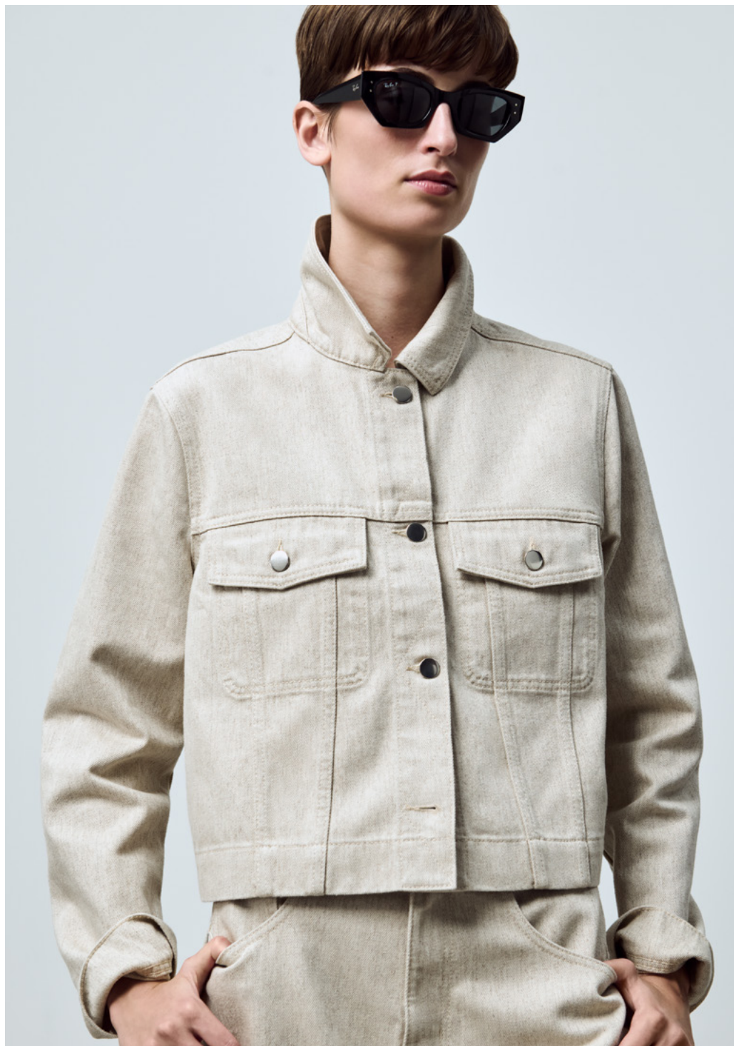
John Lewis Denim Jacket, Ecrú, £69 Jeans, Beige, £69 Coat, Yellow, £139 Intentional Maxi Leather Hobo Bag, Black, £149 Ray-Ban Sunglasses, £130