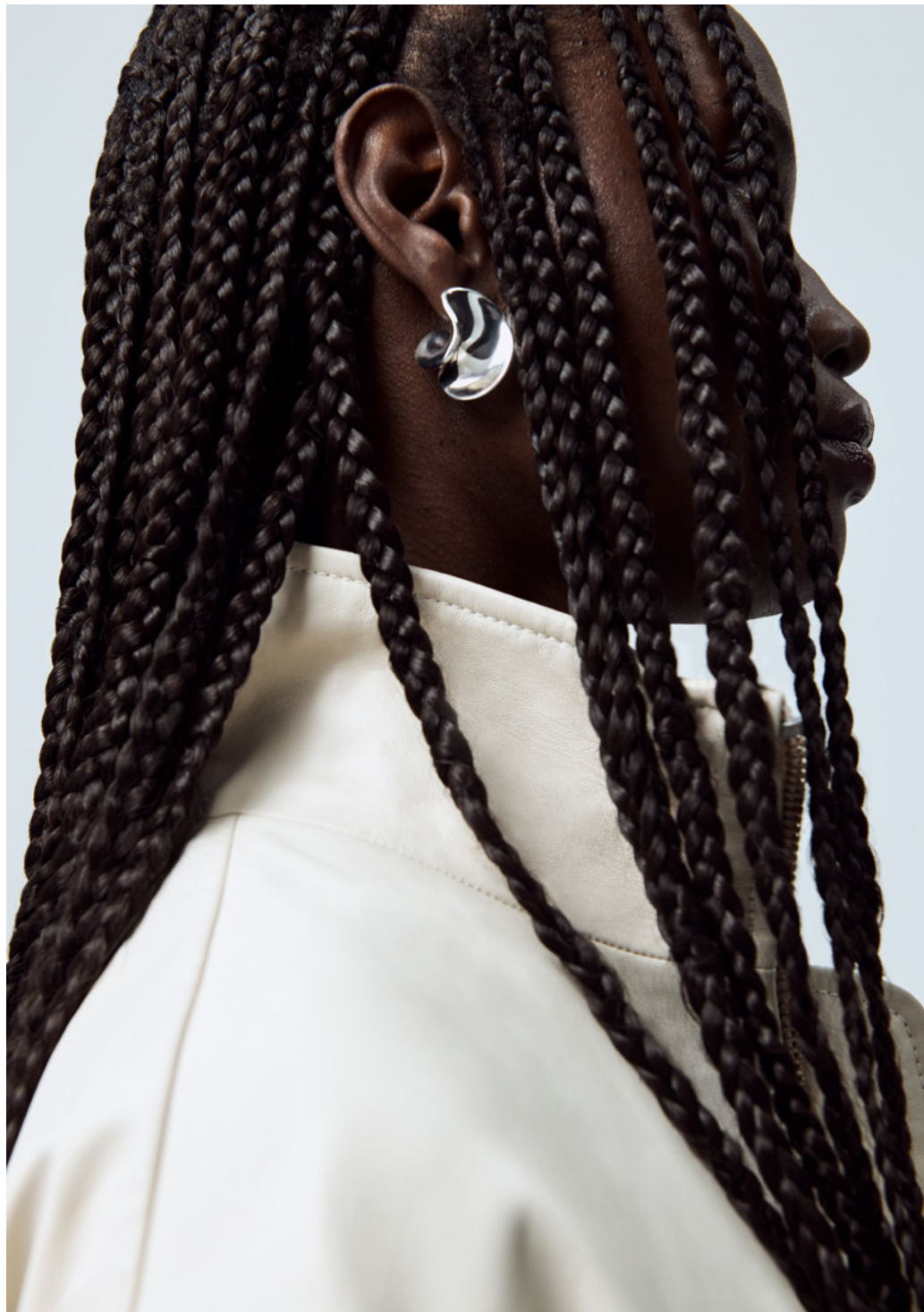
All Saints Flor Jacket , Cream, £459 By Malene Birger Lace Dress , Off White, £370