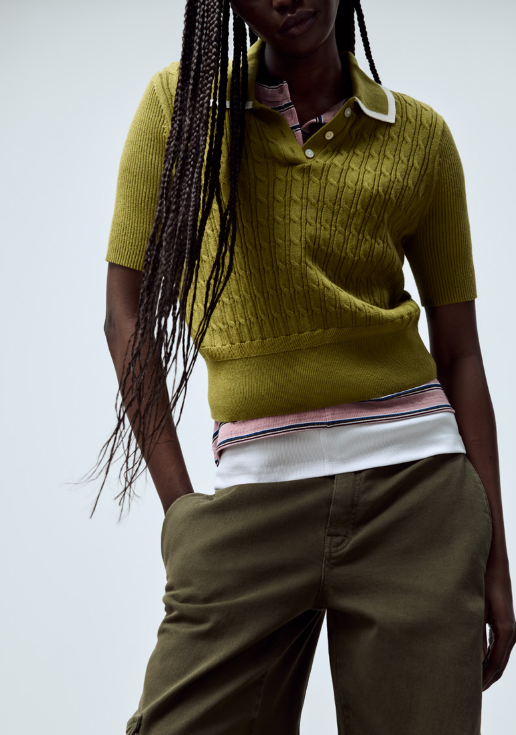
AND/OR Knitted Polo, Green Olive, £49 T-shirt, White, £25 Pants, Green Khaki, £79