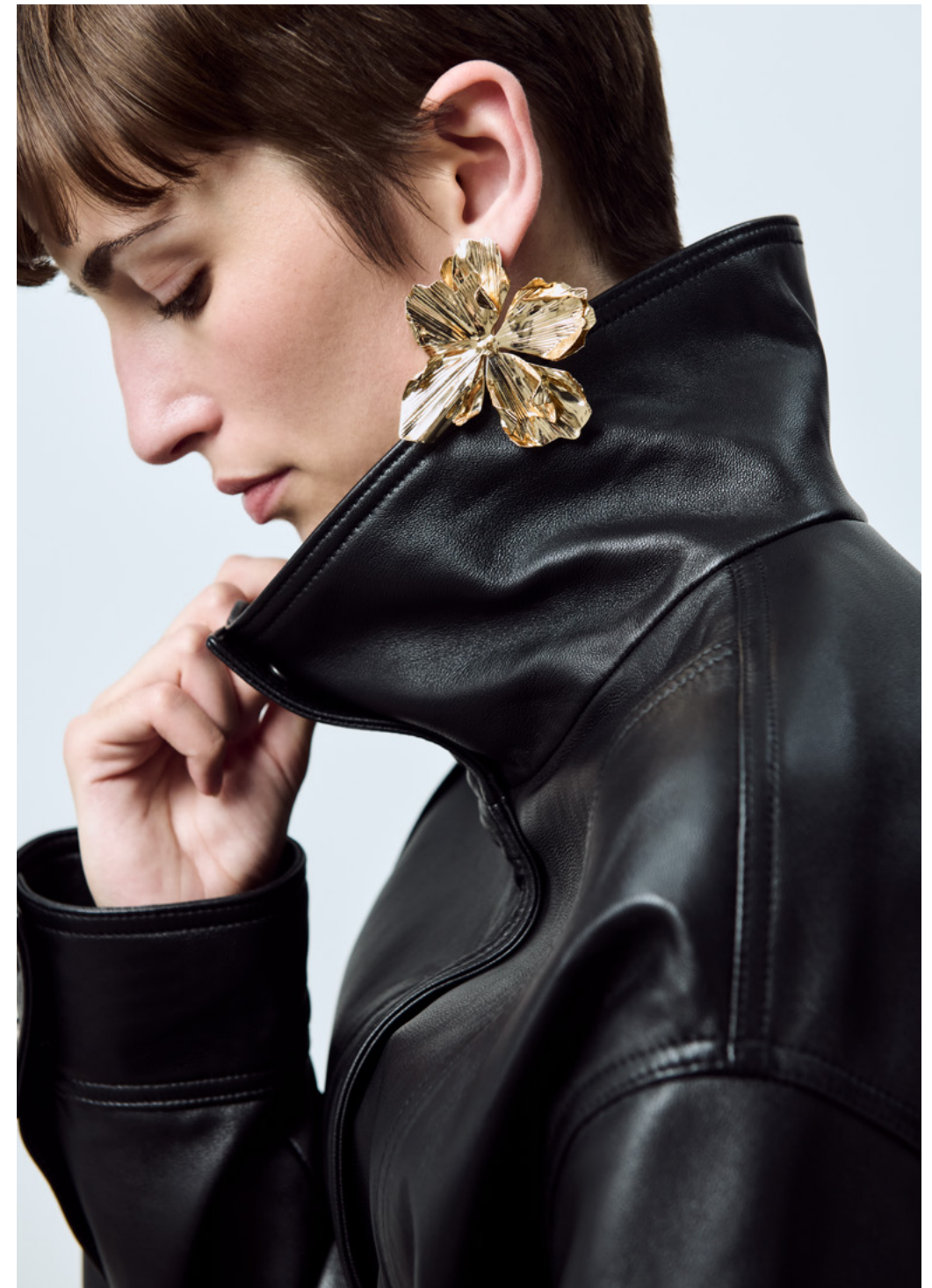
John Lewis Leather Jacket, Black, £349 Full Spliced Skirt, Print White/Multi, £69