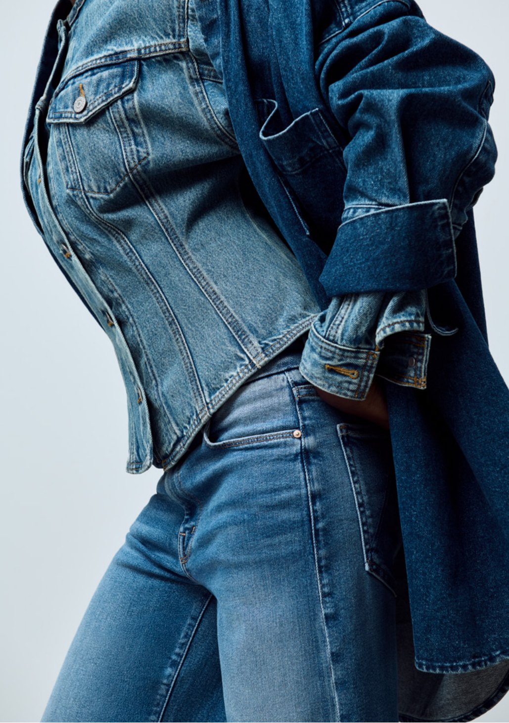
Akyn Fenella Denim Shirt, Mid Wash Blue, £320 Levi's Sculpted Trucker Denim Jacket, Dolly Day, £140 Mother The Roller Fray Jeans, Fan Favorite, £286