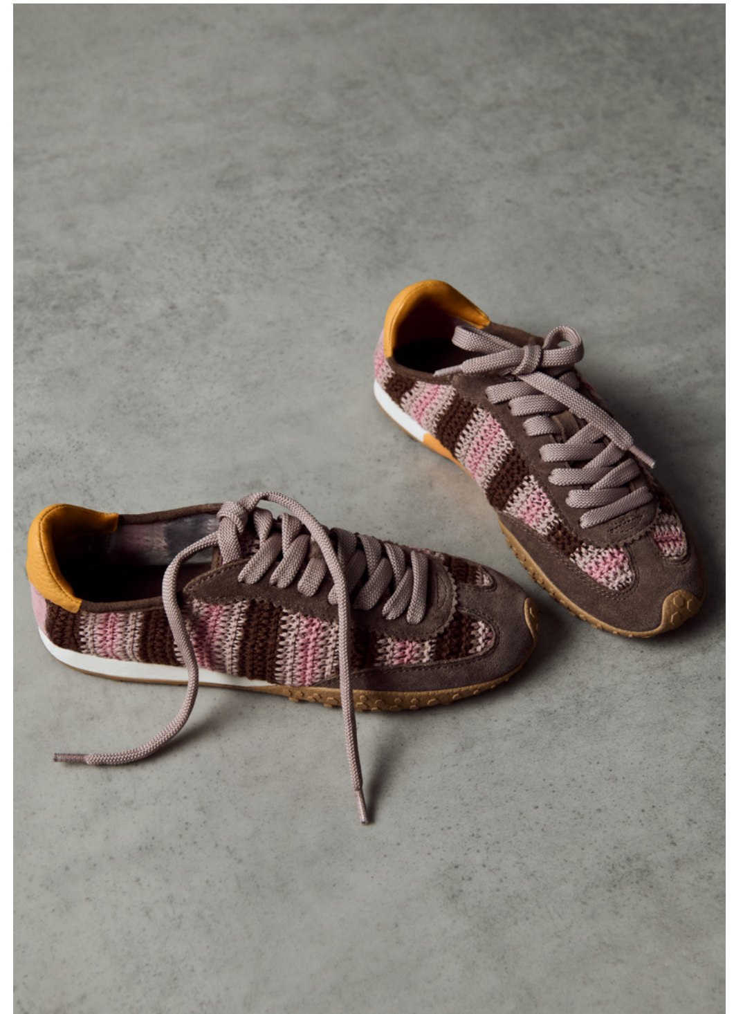
By Malene Birger Cebelli Bag , Burgundy, £420 Hoff Bridge Woven Trainer , Brown/Multi, £160