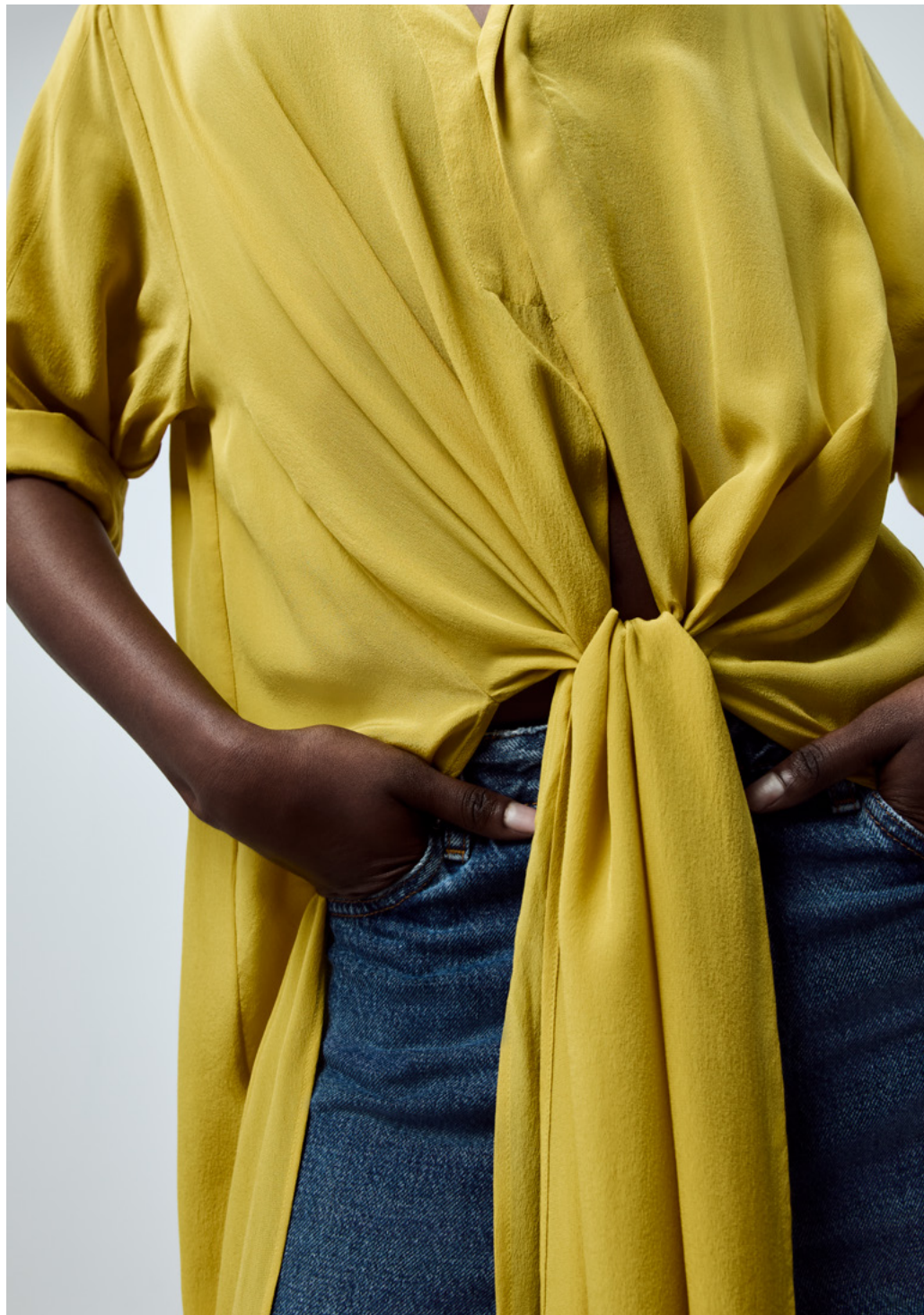
Amanda Wakeley Sophia Airwrap Shirt, Saffron , £350 Frame The Slice Flare, Headliner , £390 Topshop Co-ord Cinched Padded Shoulder Blazer, Taupe , £75