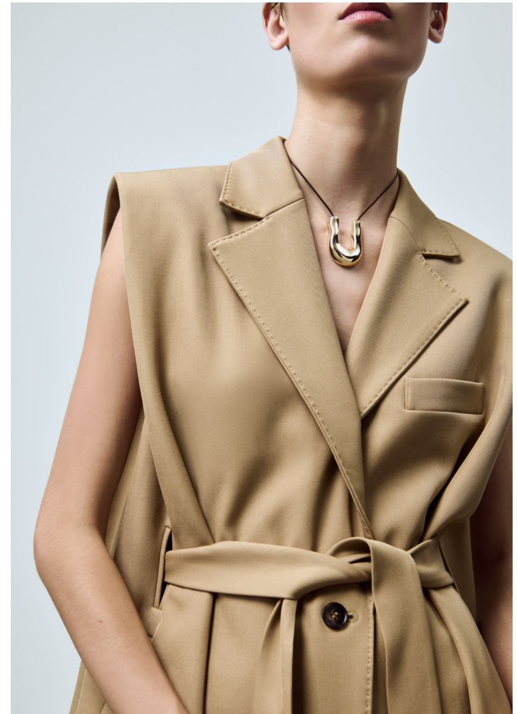
John Lewis Cape Waistcoat, Natural/Beige, £99 Melange Bootcut Trousers, Natural/Beige, £69 Trench Coat, Natural/Beige, £139 Ruched Leather Flapover Bag, Red, £119