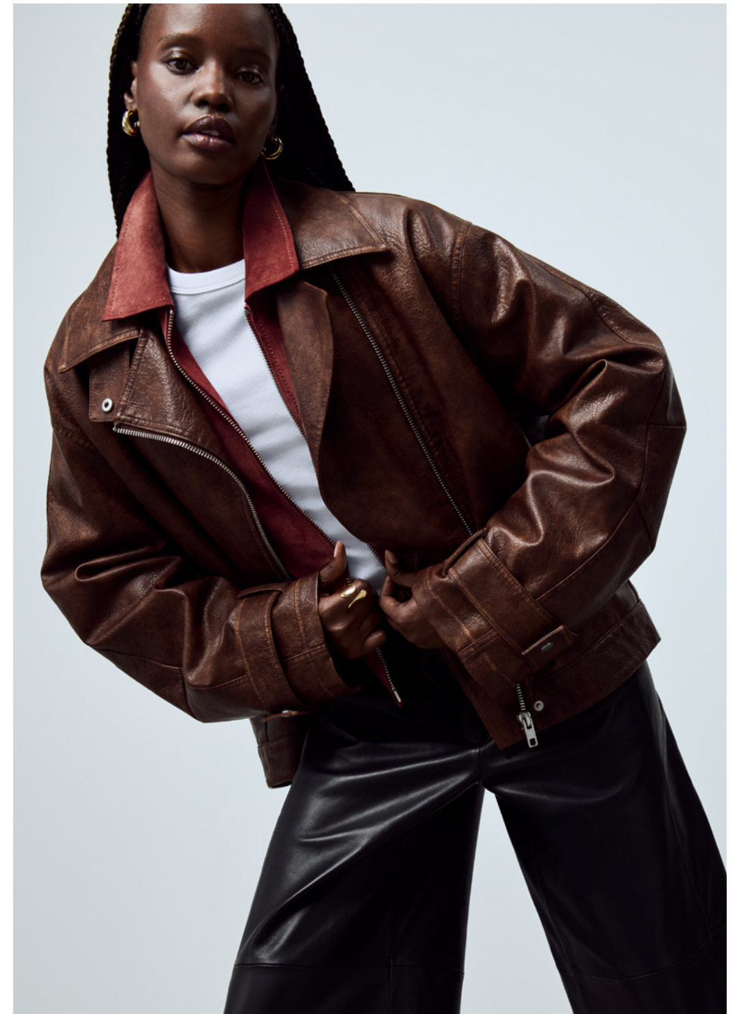
AND/OR Top, White, £25 Samsøe Samsøe Salylo Suede Jacket, Fired Brick, £390 Selected Femme Leather Culottes, Black, £240 Topshop Leather Look Biker Jacket, Washed Brown, £80