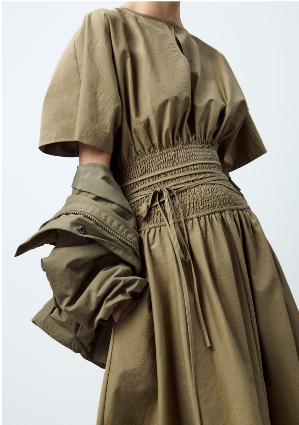
John Lewis Shirred Waist Dress , Natural, £119