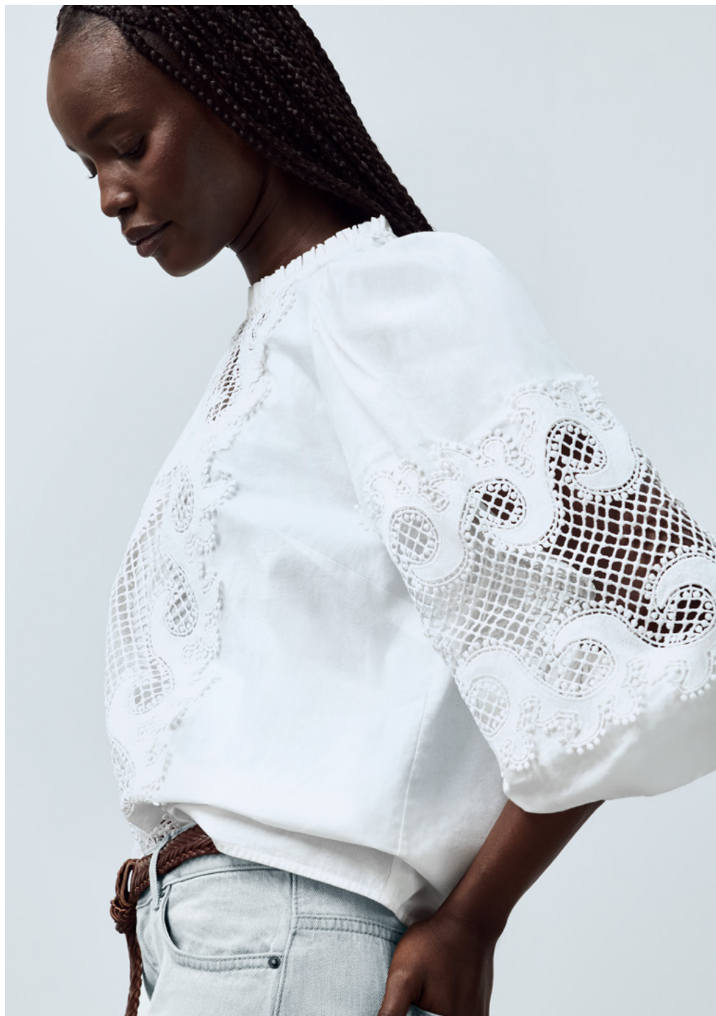
AND/OR Lace Top, White, £79 Jacket, Green Khaki, £99 Light Wash Jeans, Vintage Wash, £79 John Lewis Ruched Suede Flapover Bag, £119