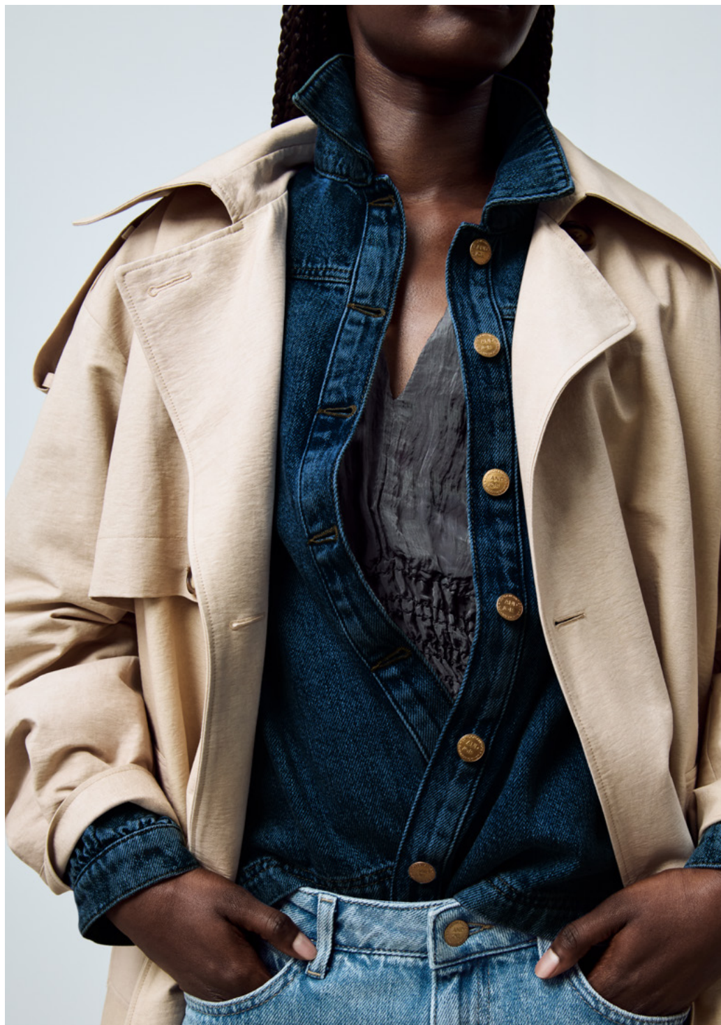
AND/OR Top, Charcoal, £59 Jean Jacket, Vintage Blue Wash, £79 Trench Coat, Natural, £139 Jeans, Vintage Blue Wash, £79