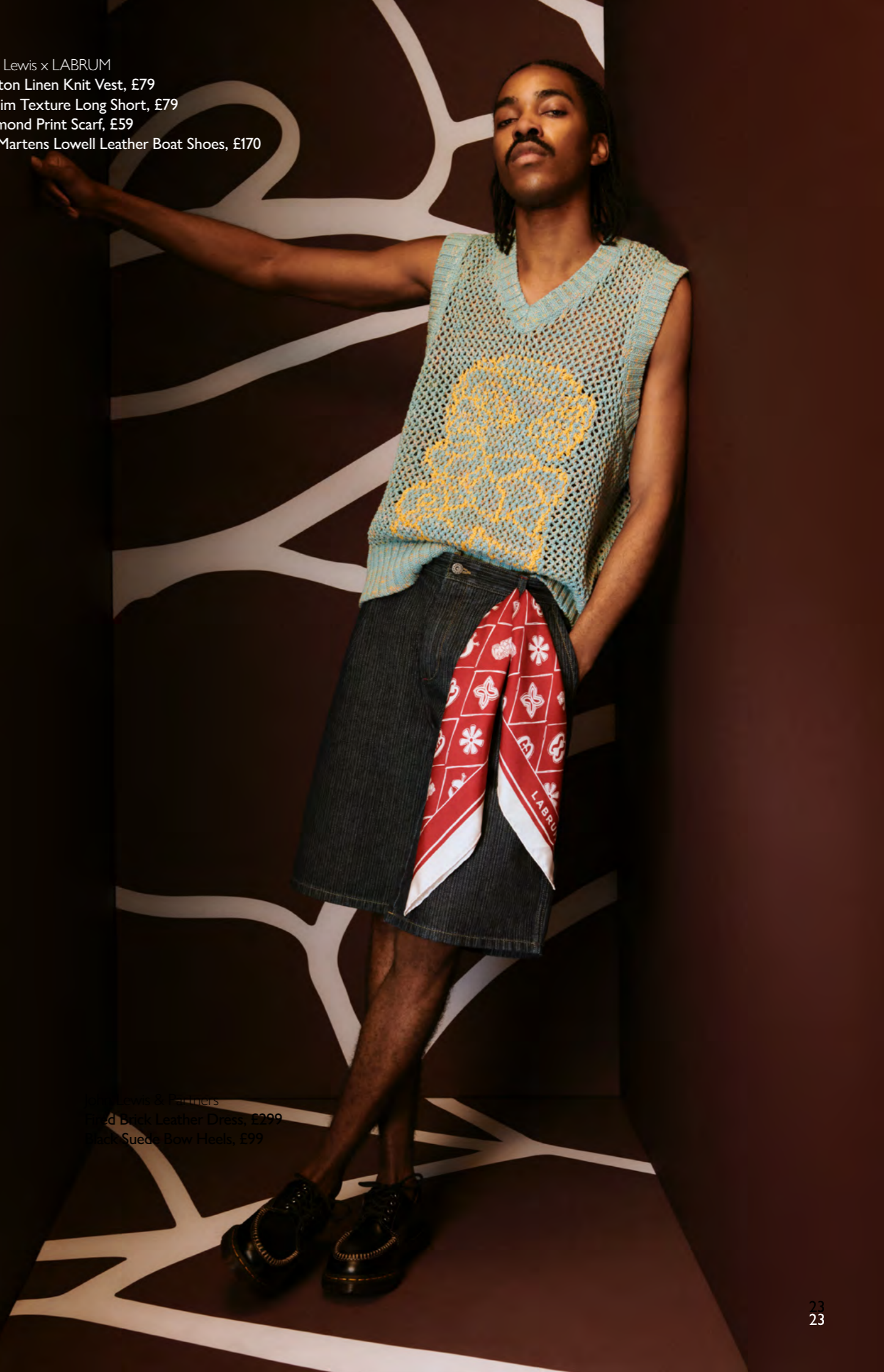
John Lewis x LABRUM Cotton Linen Knit Vest, £79 Denim Texture Long Short, £79 Diamond Print Scarf, £59 Dr. Martens Lowell Leather Boat Shoes, £170