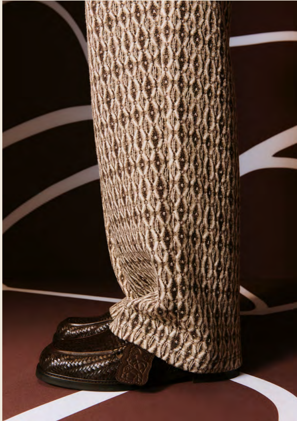
John Lewis x LABRUM Jacquard Jogger, £99 Square Toe Plaited Shoe, £129