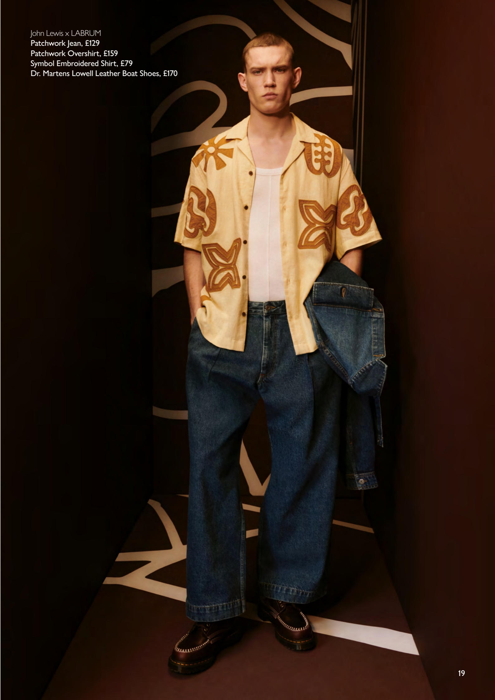
John Lewis x LABRUM Patchwork Jean, £129 Patchwork Overshirt, £159 Symbol Embroidered Shirt, £79 Dr. Martens Lowell Leather Boat Shoes, £170