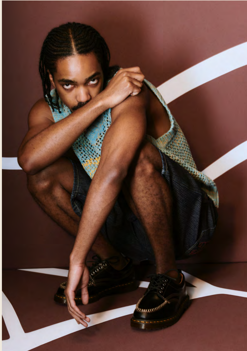
John Lewis x LABRUM Cotton Linen Knit Vest, £79 Denim Texture Long Short, £79 Diamond Print Scarf, £59 Dr. Martens Lowell Leather Boat Shoes, £170