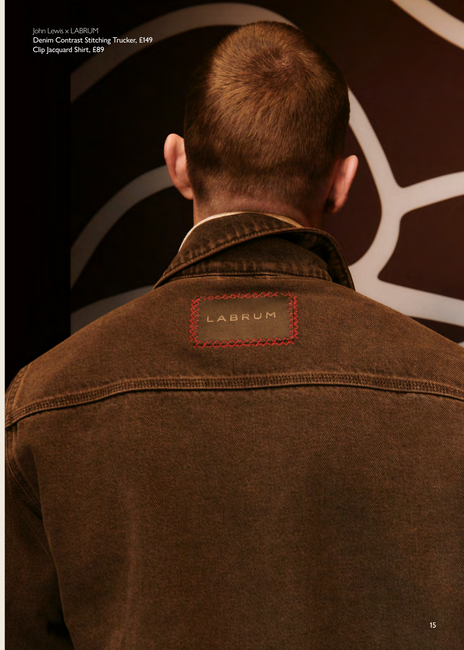
John Lewis x LABRUM Denim Contrast Stitching Trucker, £149 Clip Jacquard Shirt, £89