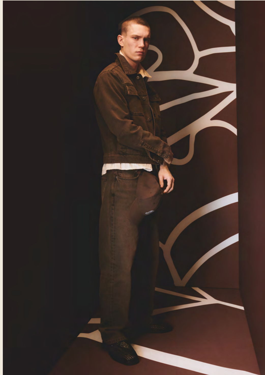
John Lewis x LABRUM Denim Contrast Stitching Tracker Jacket, £149 Symbol Nomoli Brown Jean, £109 Clip Jacquard Shirt, £89 Nomoli Cap, £39 Square Toe Plaited Shoe, £129