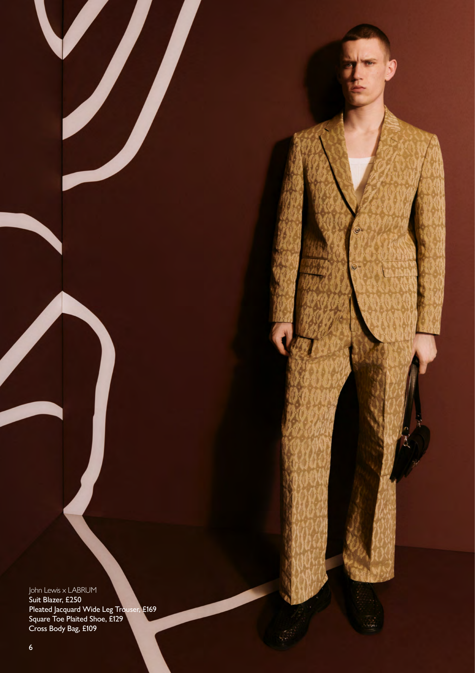
John Lewis x LABRUM Suit Blazer, £250 Pleated Jacquard Wide Leg Trousers, £169 Square Toe Plaited Shoe, £129 Cross Body Bag, £109