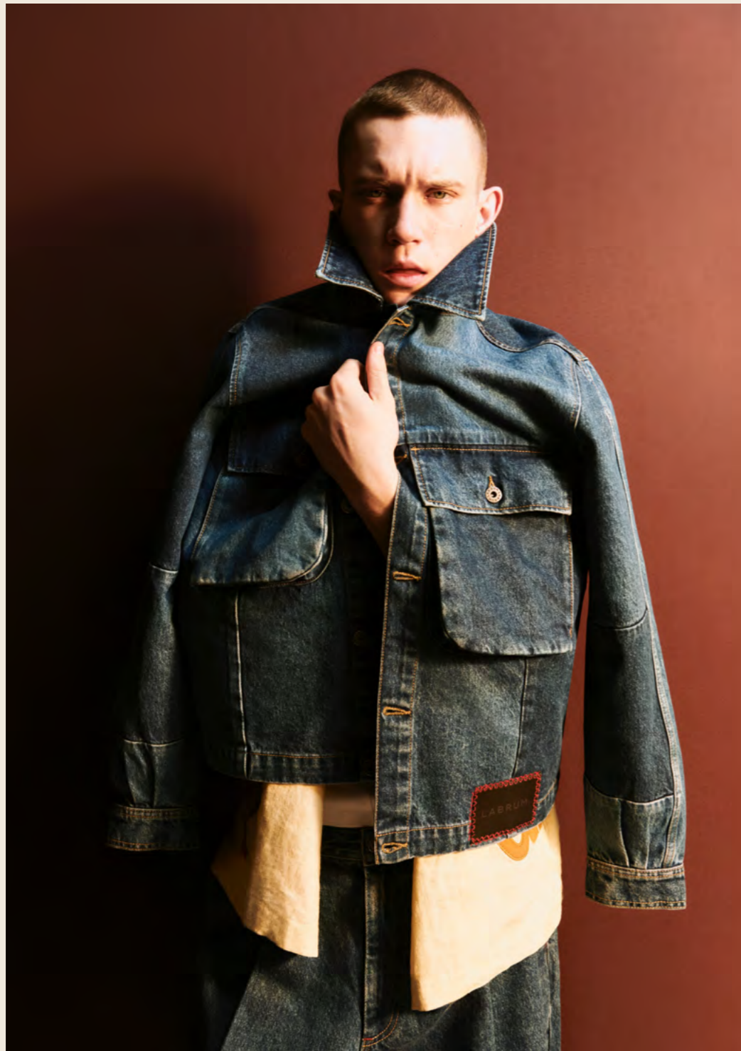
John Lewis x LABRUM Patchwork Jean, £129 Patchwork Overshirt, £159 Symbol Embroidered Shirt, £79