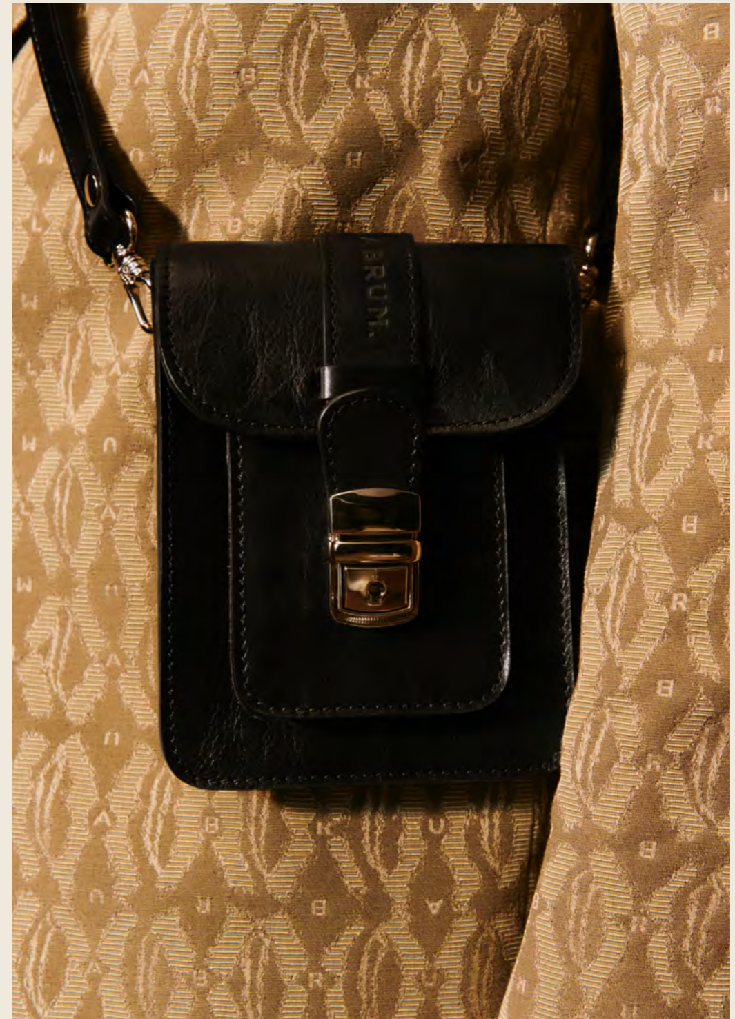
John Lewis x LABRUM Suit Blazer, £250 Cross Body Bag, £109