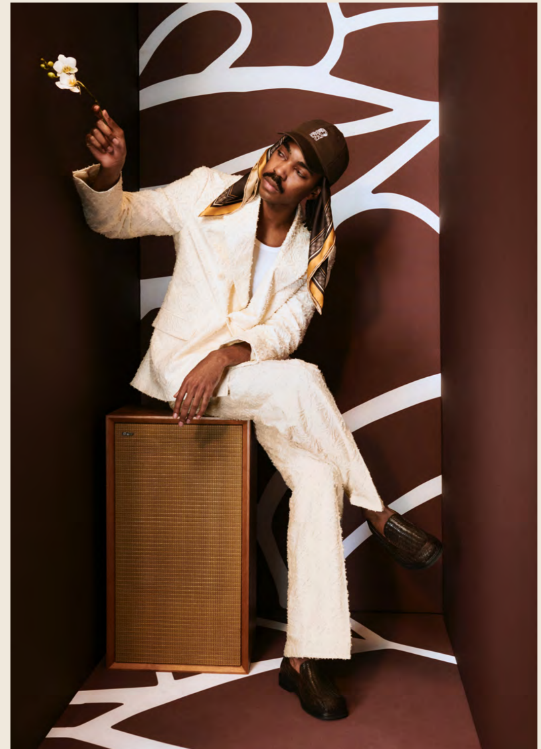
John Lewis x LABRUM Double Breasted Jacquard Blazer, £250 Suit Trousers, £169 Square Toe Plaited Shoe, £129 Nomoli Cap, £39 Logo Silk Scarf, £59

The Labrum collaboration returns for a second season, launching in store and online 19th March.