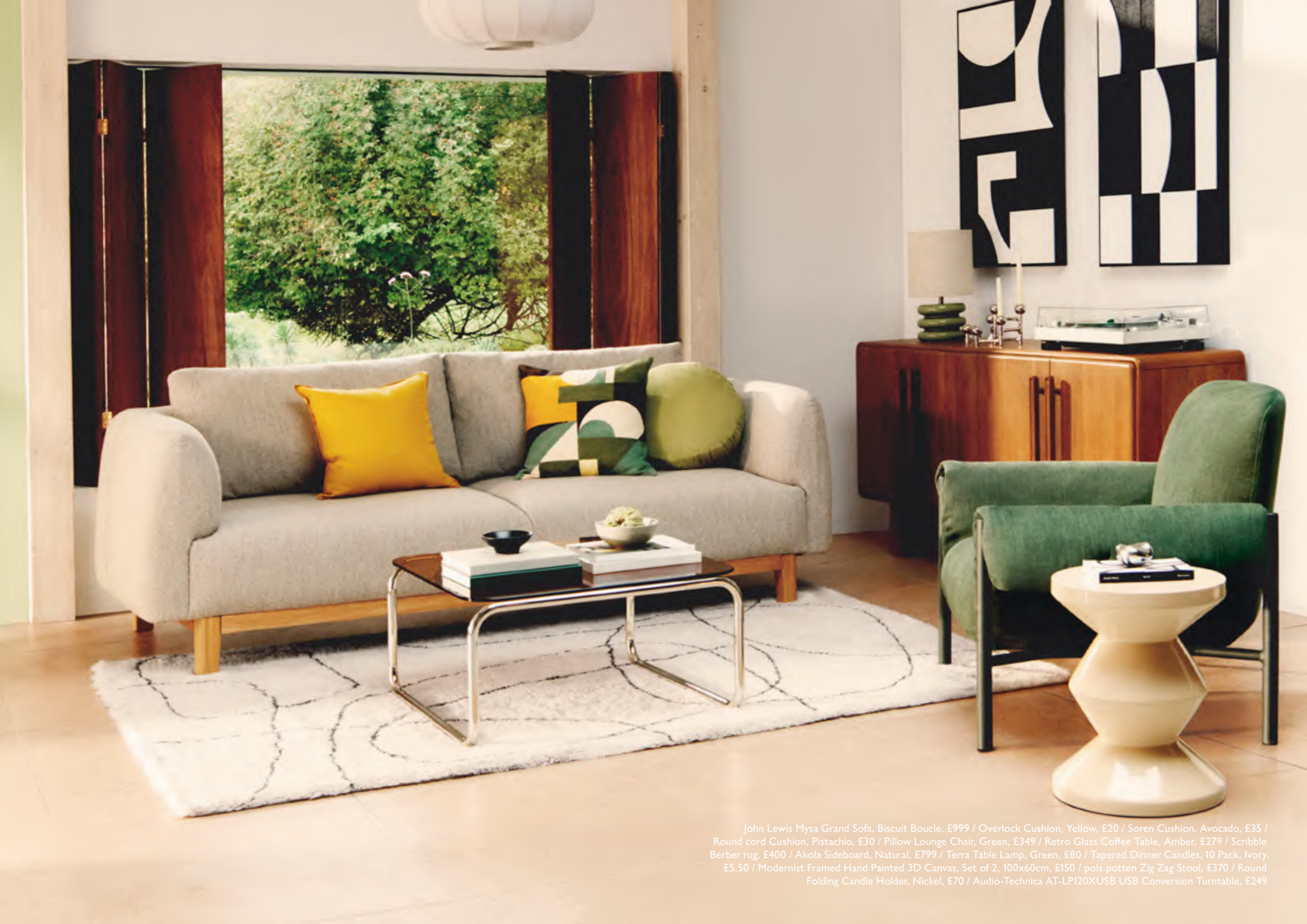
John Lewis Myna Grand Sofa, Biscuit Boucle, £999 / Overlock Cushion, Yellow, £20 / Soren Cushion, Avocado, £35 / Round cord Cushion, Pistachio, £30 / Pillow Lounge Chair, Green, £349 / Retro Glass Coffee Table, Amber, £279 / Scribble Berber rug, £400 / Akola Sideboard, Natural, £799 / Terra Table Lamp, Green, £80 / Tapered Dinner Candles, 10 Pack, Ivory, £5.50 / Modernist Framed Hand Painted 3D Canvas, Set of 2, 100x60cm, £150 / pols potten Zig Zag Stool, £370 / Round Folding Candle Holder, Nickel, £70 / Audio-Technica AT-LP120XUSB USB Conversion Turntable, £249