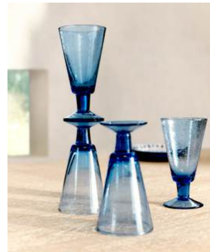
ABOVE: John Lewis Coastal wine glass, Blue, £9