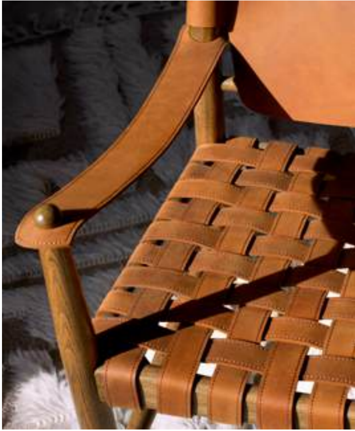
ABOVE: John Lewis Rove Woven Leather Chair, £799 / Jazz Shaggy Rug, £600