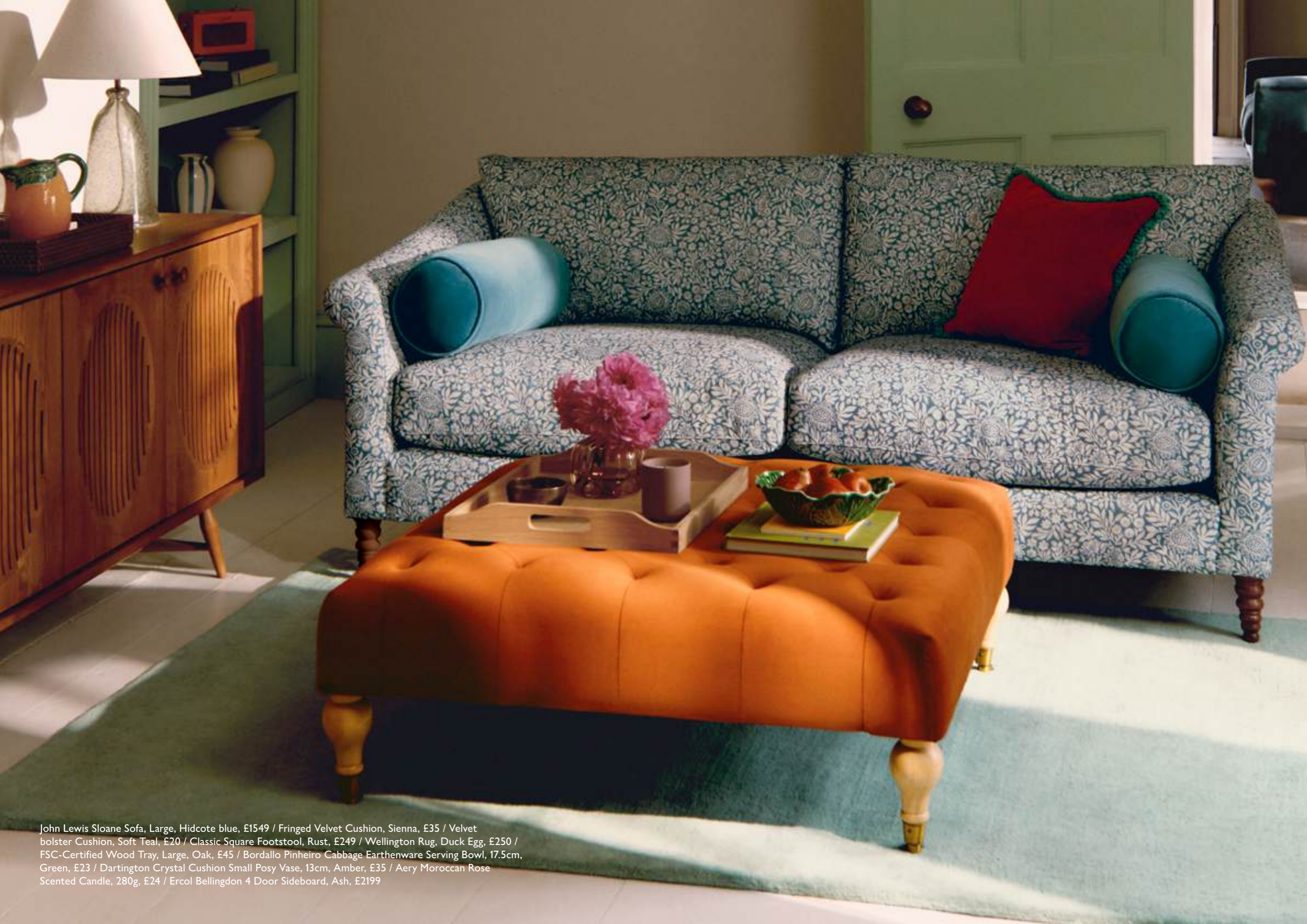
John Lewis Sloane Sofa, Large, Hidcote blue, £1549 / Fringed Velvet Cushion, Sienna, £35 / Velvet bolster Cushion, Soft Teal, £20 / Classic Square Footstool, Rust, £249 / Wellington Rug, Duck Egg, £250 / FSC-Certified Wood Tray, Large, Oak, £45 / Bordallo Pinheiro Cabbage Earthenware Serving Bowl, 17.5cm, Green, £23 / Dartington Crystal Cushion Small Posy Vase, 13cm, Amber, £35 / Aery Moroccan Rose Scented Candle, 280g, £24 / Ercol Bellingdon 4 Door Sideboard, Ash, £2199