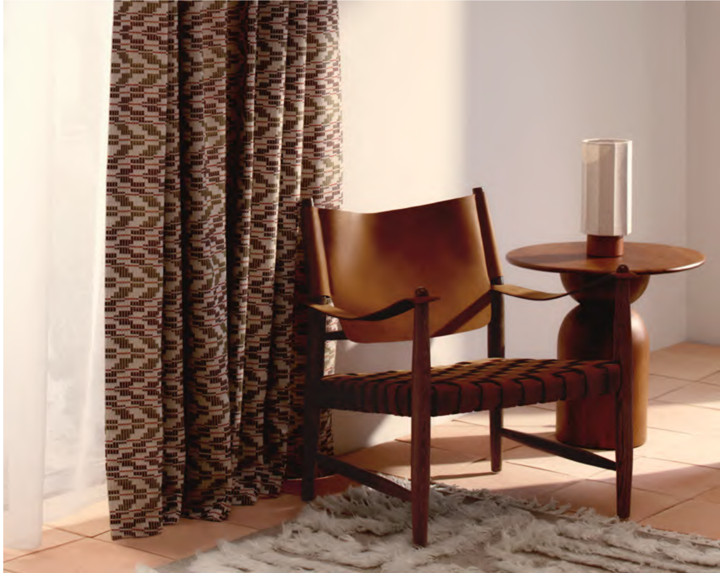
RIGHT: John Lewis Rove Woven Leather Chair, £799 / Jazz Shaggy Rug, £600 / Adina Side Table, £249 / Deca Table Lamp, £50 / Merida Chevron Fabric, Bronze Green, £35 P/M