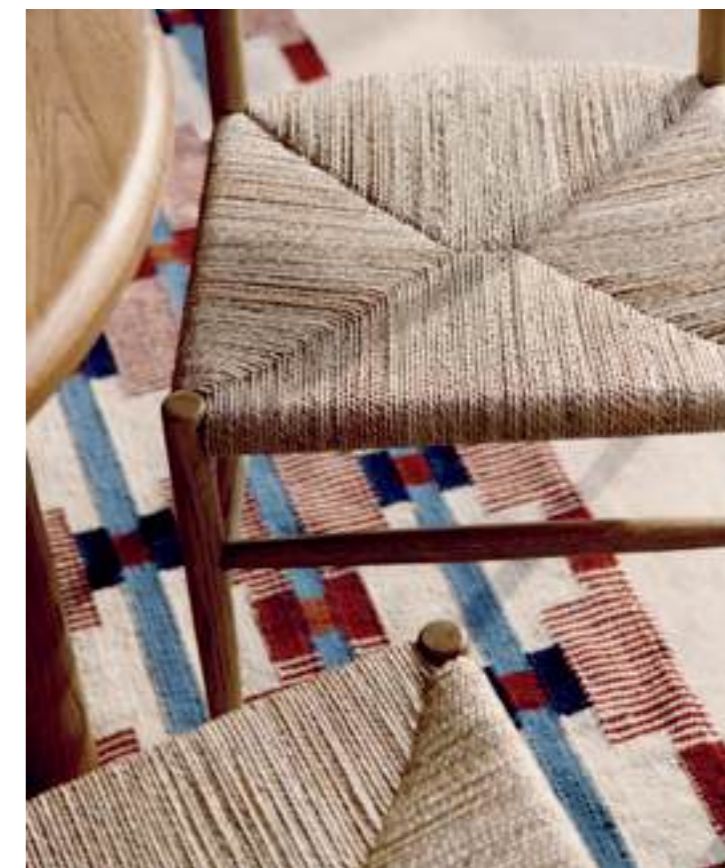
ABOVE: John Lewis Willow Seagrass Woven Chair, Oak, £199 / Calado Burnt Umber rug, £350