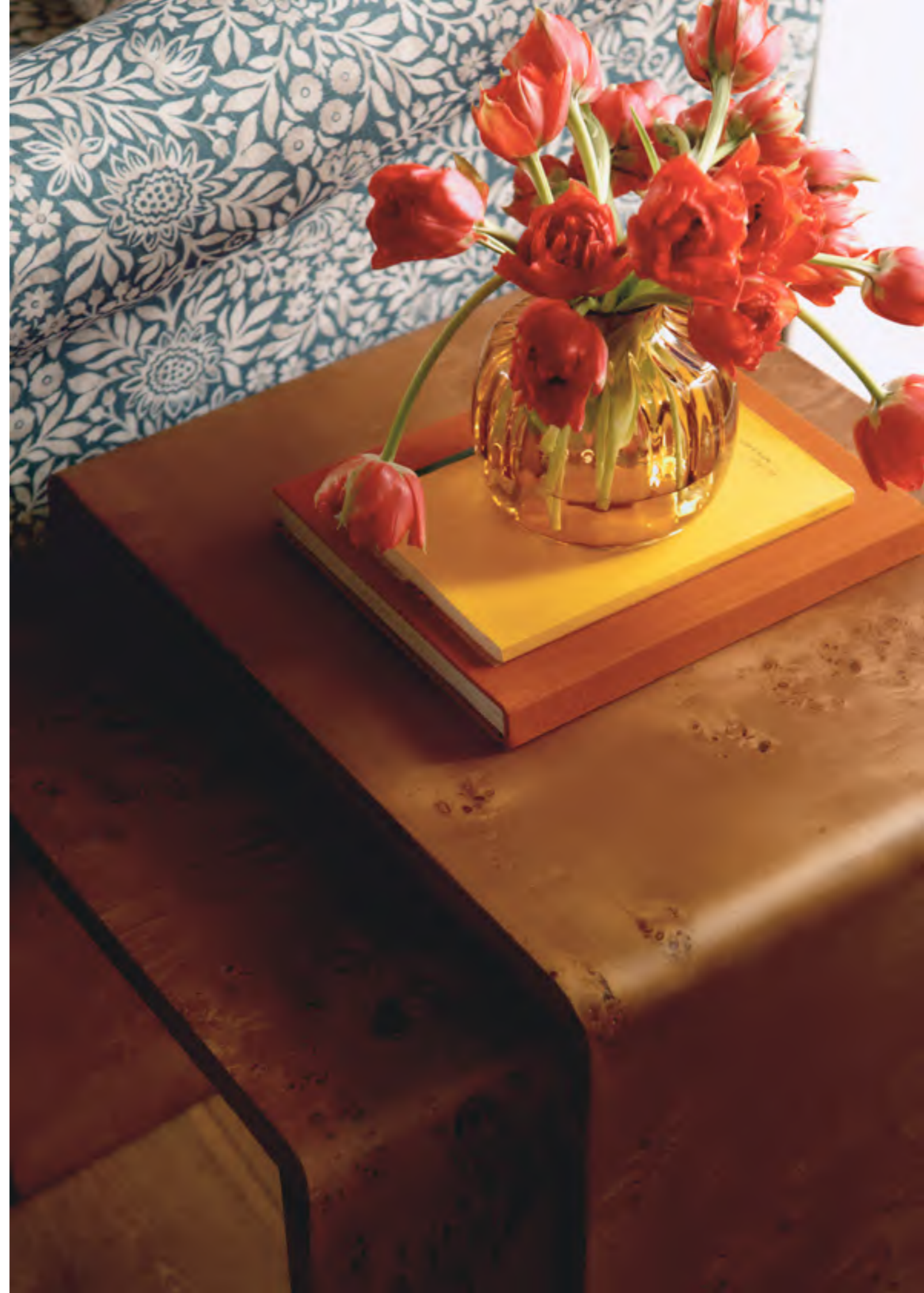
RIGHT: John Lewis Burl Nest of 2 Tables, £399 / Sloane Large Sofa, Hidcote blue, £1549 / Dartington Crystal Cushion Small Posy Vase, H13cm, Amber, £35