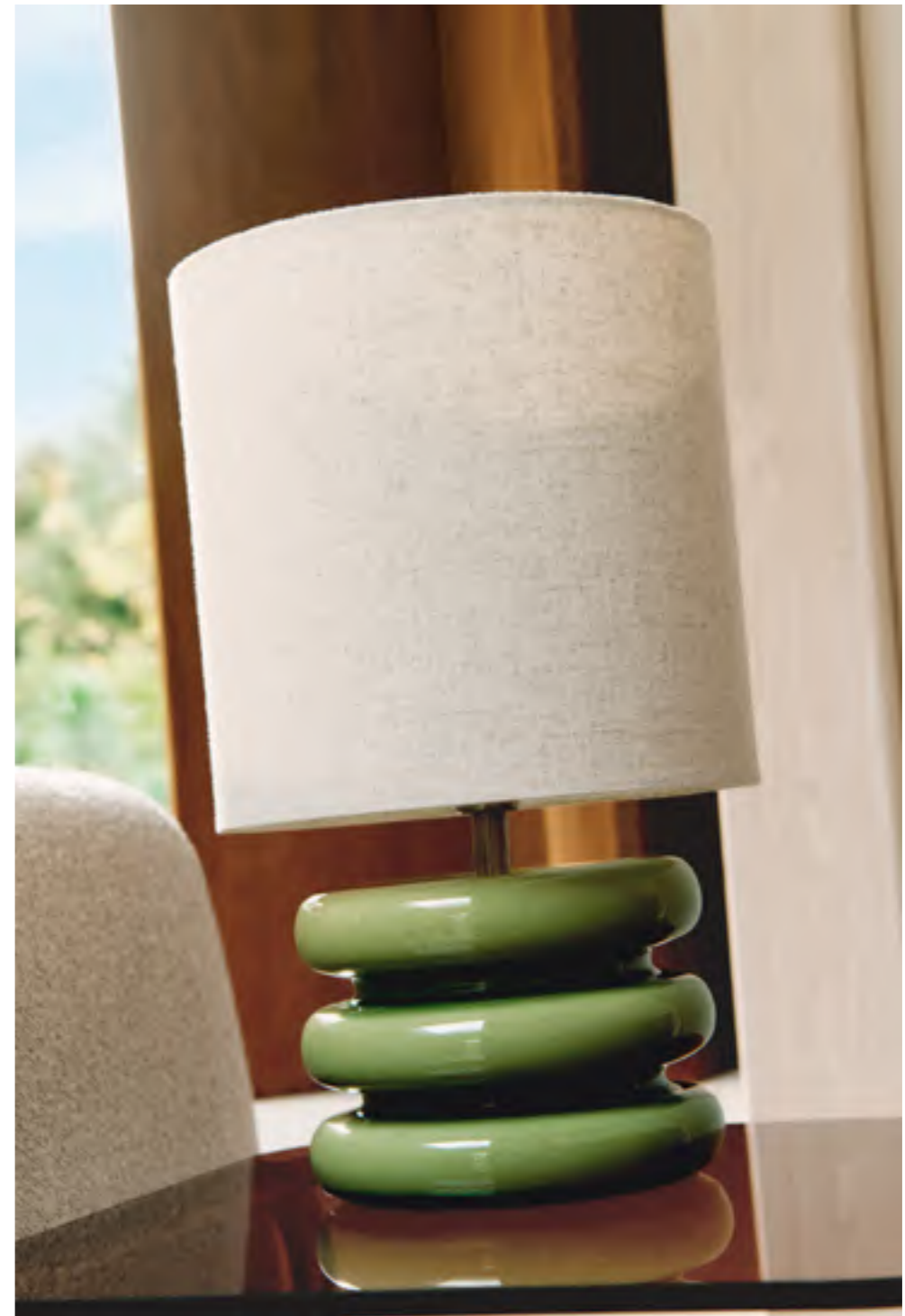
ABOVE: John Lewis Terra Table Lamp, Green, £80 / Retro Side Table, Amber Glass, £179