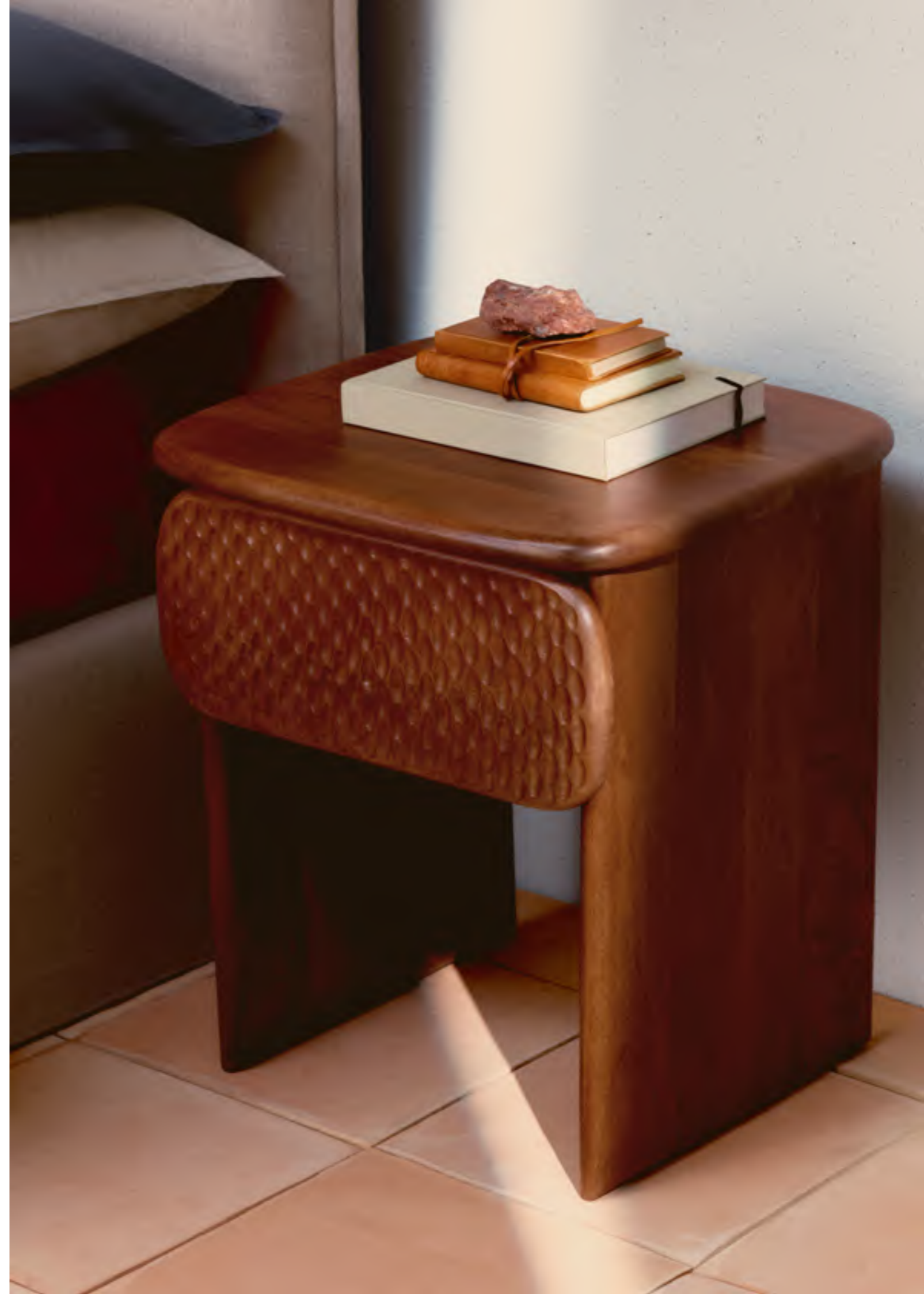
RIGHT: John Lewis Pebble 1 Drawer Bedside Table, £199