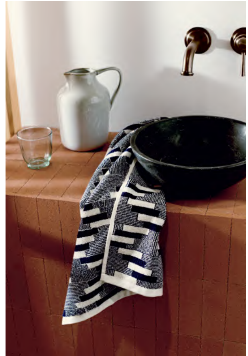
John Lewis Mirrored Slatted Bathroom Cabinet, Natural, £160 / Miche Double Bathroom Wall Light, Bronze, £100 / Iver Reactive Glaze Stoneware Jug, 1.8L, Moonlight, £20 / Leckford Recycled Glass Tumbler, £5 / Soap dish, Amber, £8 / Paz Bath Mat, Dark Night Sky, £35 / Milta Hand Towel, Dark Night Sky, £15 / Castillo Hand Towel, Burnt Umber, £15 / Milta Hand Towel, Bronze Green, £15 / Ola Hand Towel, Dark Night Sky, £15 / Glass, Amber, £12 / Diptyque 34 Boulevard Saint Germain Scented Candle, 300g, £85