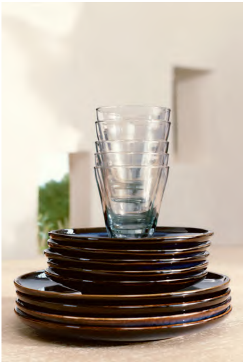
ABOVE: John Lewis Coastal Recycled Tumbler, £5 / Iver Reactive Glaze Stoneware Dinner Plate, 27.4cm, Blue, £8 / Side Plate, 21cm, Blue, £7