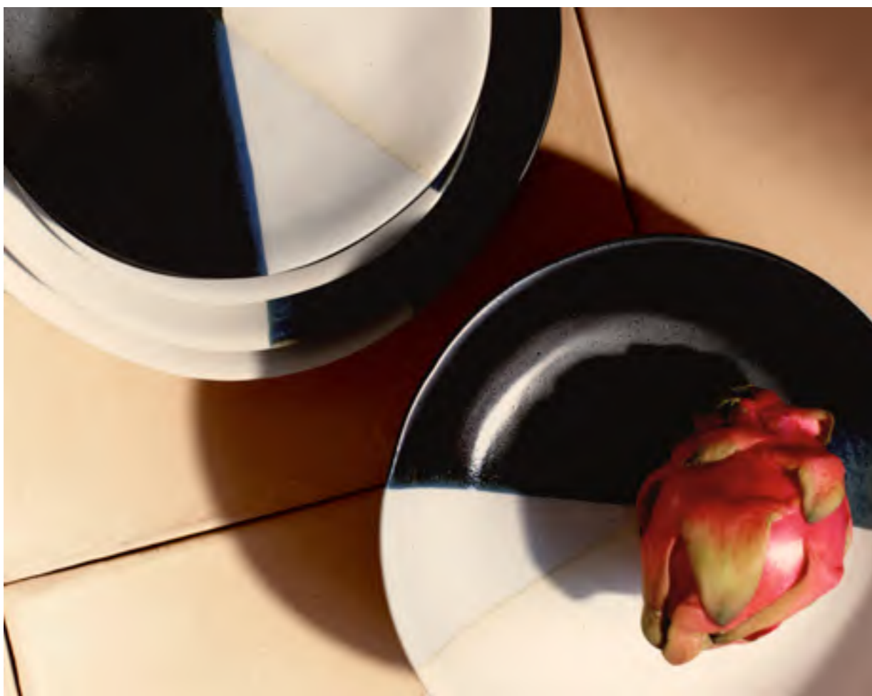
ABOVE: John Lewis Dipped Reactive Black Dinner Plate, £10 / Side Plate, £8 / Cereal Bowl, £8 / Pasta Bowl, £10