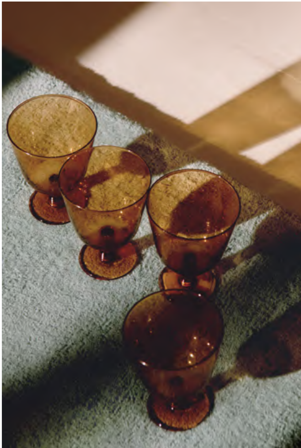
ABOVE: John Lewis Modern Rustic Wine Glass, Ochre, £9 / Wellington Rug, L230xW160cm, Duck Egg, £250