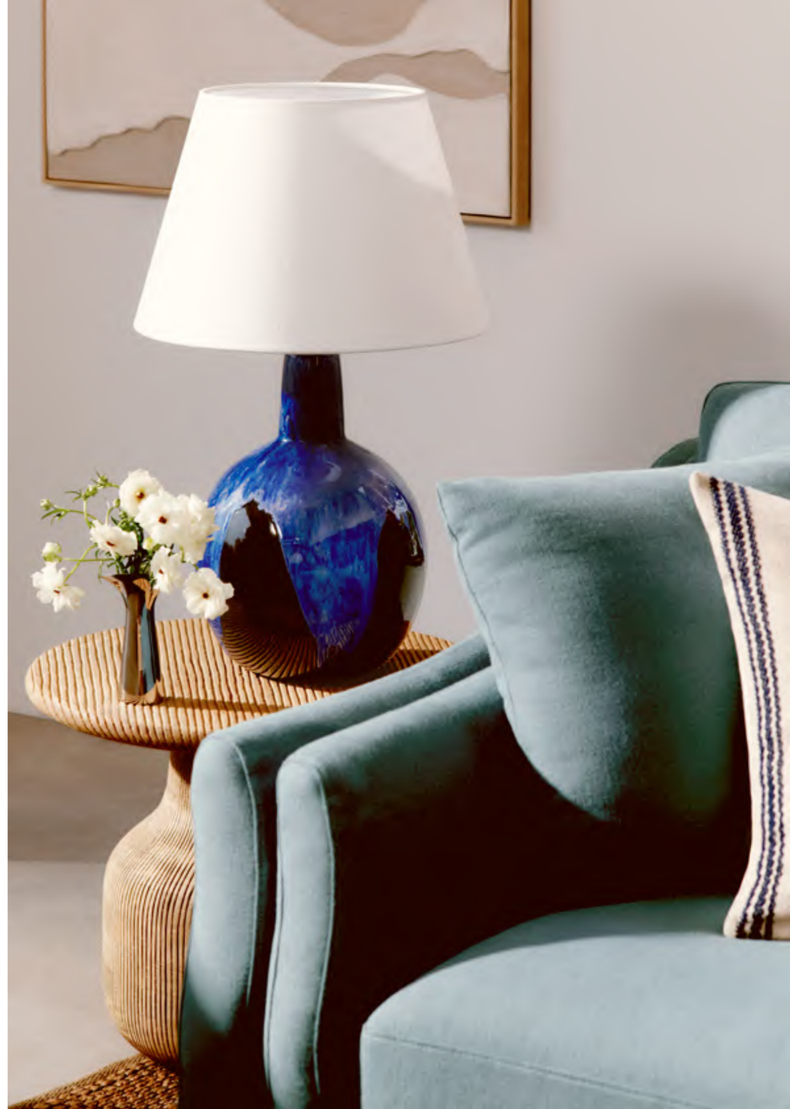
RIGHT: John Lewis Soluna Lamp Base, Indigo, £130 / Sophia Pure Linen Tapered 40cm Lamp Shade, Lilly White, £60 / Bude Medium sofa, Ocean Linen, £1499 / nkunku Vivan Grooved Wood Side Table, £520 / Azzarro Cushion, Raya Stripe, £45 / Cloud textured Wall Art, £100