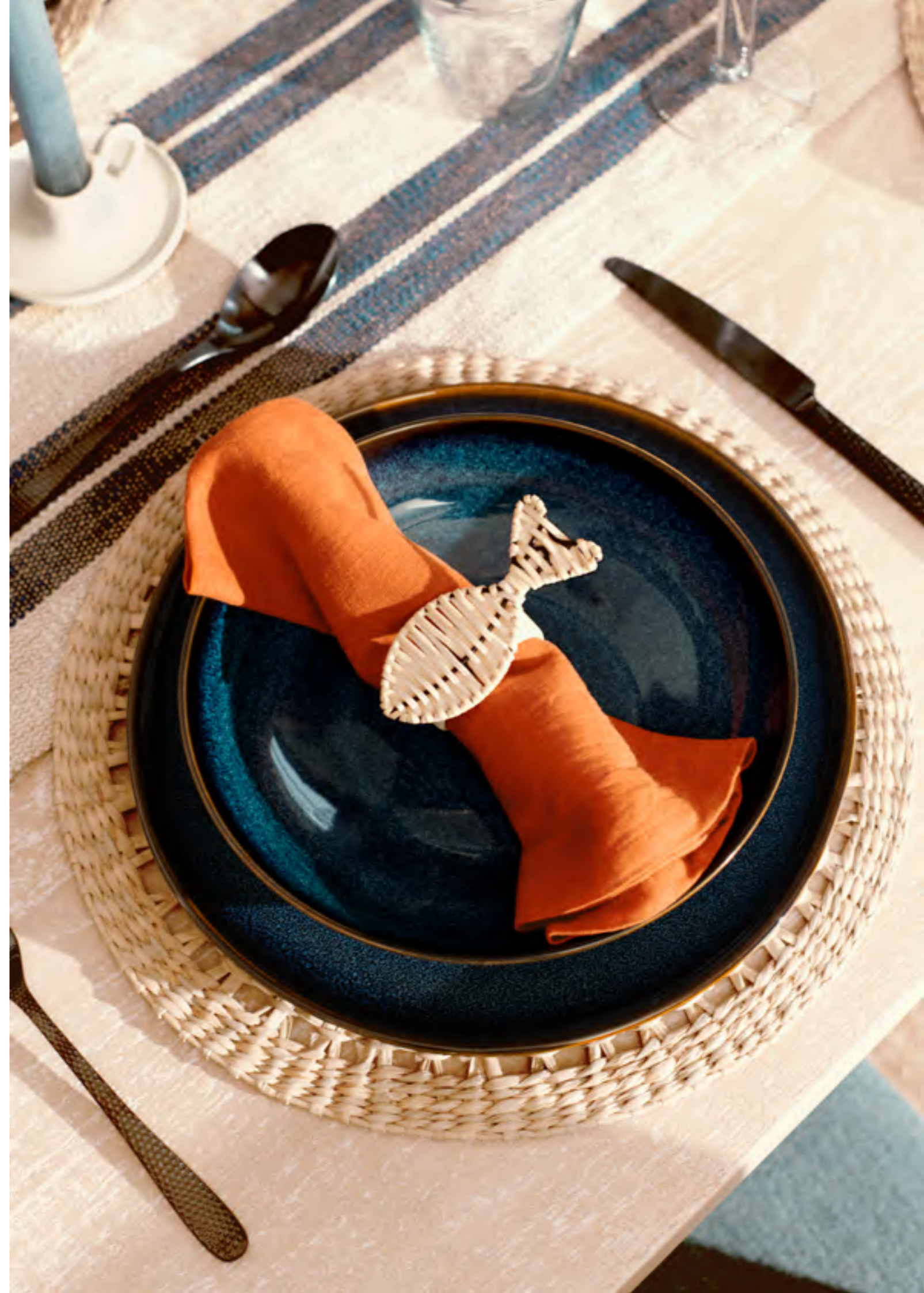
RIGHT: John Lewis Coastal Rattan Fish Napkin Ring, Set of 4, £15 / Colour Directory Napkin, Set of 4, Sienna, £25 / Iver Reactive Glaze Stoneware Dinner Plate, 27.4cm, Blue, £8 / Cereal Bowl, 16cm, Blue, £7 / Woven Placemat, Set of 4, £20 / Coastal Cotton Jute Stripe Runner 40x250cm, £26 / Lynton Dining Table, £1149 / Brook 16 piece cutlery set, £60