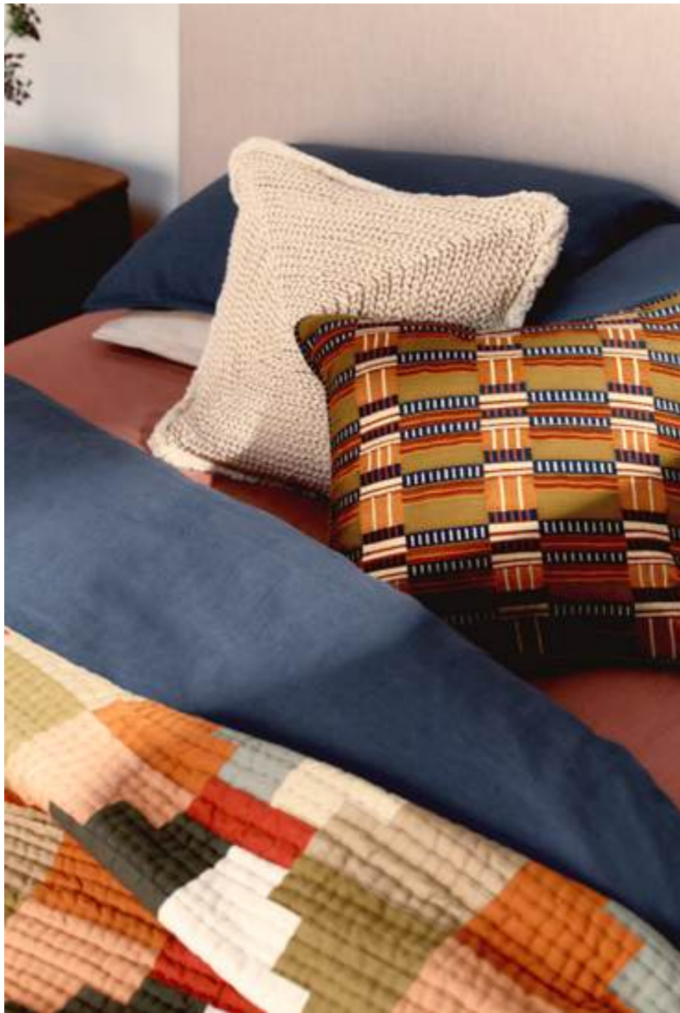
ABOVE: John Lewis Relaxed Pillow Bed, Putty Linen, £799 / Comfy & Relaxed Washed Linen Standard Pillowcase, Set of 2, Navy, £40 / Duvet Cover, King, Navy, £115 / 100% Linen Deep Fitted Sheet, King size, Rust, £140 / Leon Bedspread, £180 / Braided Cotton Cushion, Natural, £45 / Palenque Cushion, Bronze Green, £50