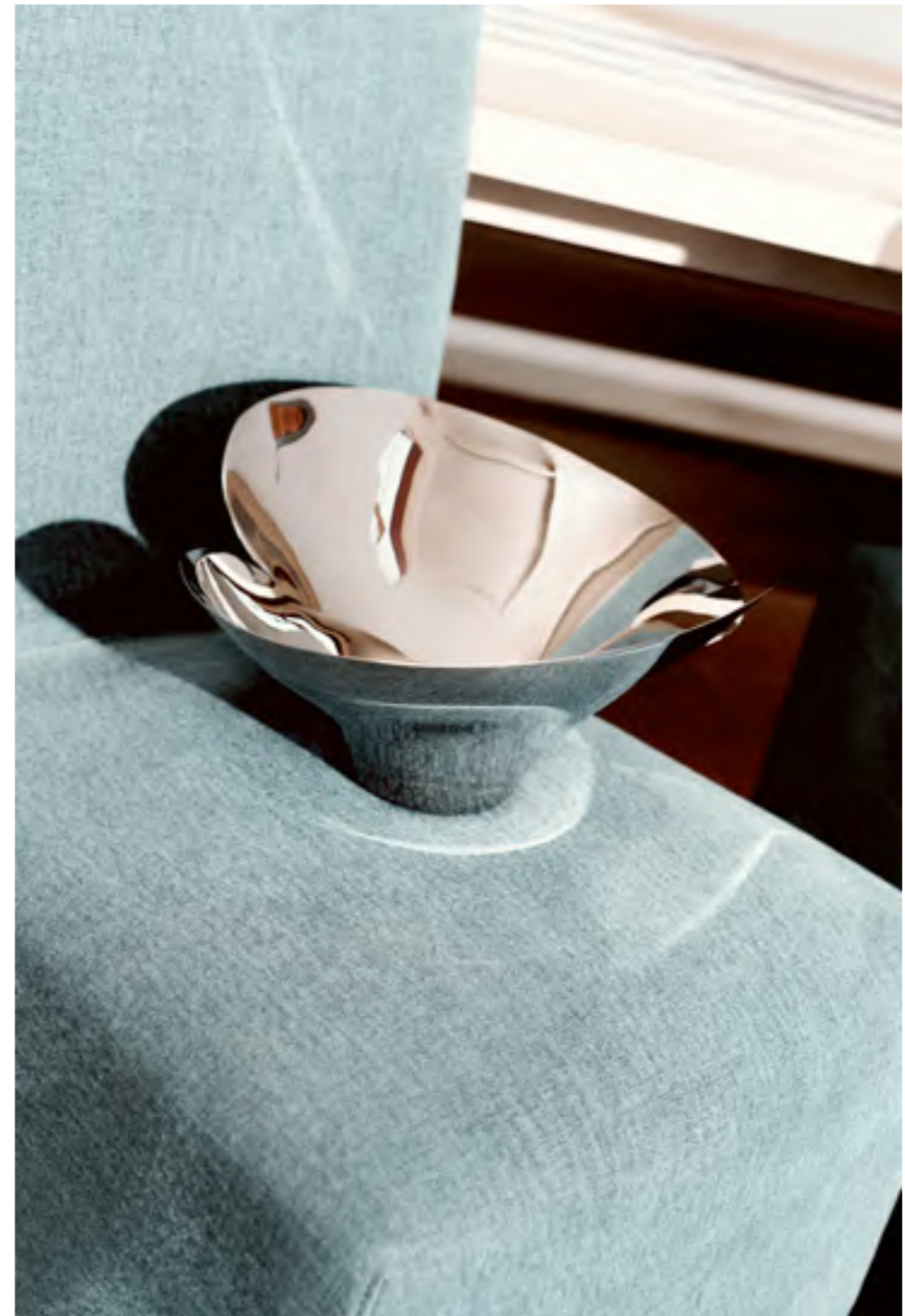
ABOVE: John Lewis Edith Loose Cover Dining Chair, Blue, £299 / Georg Jensen Bloom Stainless Steel Fruit Bowl, Large, Silver, £169