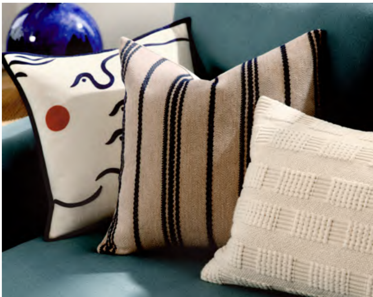
ABOVE: John Lewis Bude Medium sofa, Ocean Linen, £1499 / Coastal Birds Cushion, £35 / Rib and Loop Cushion, £50 / Azzarro Cushion, Raya Stripe, £45 / Soluna Lamp Base, Indigo, £130