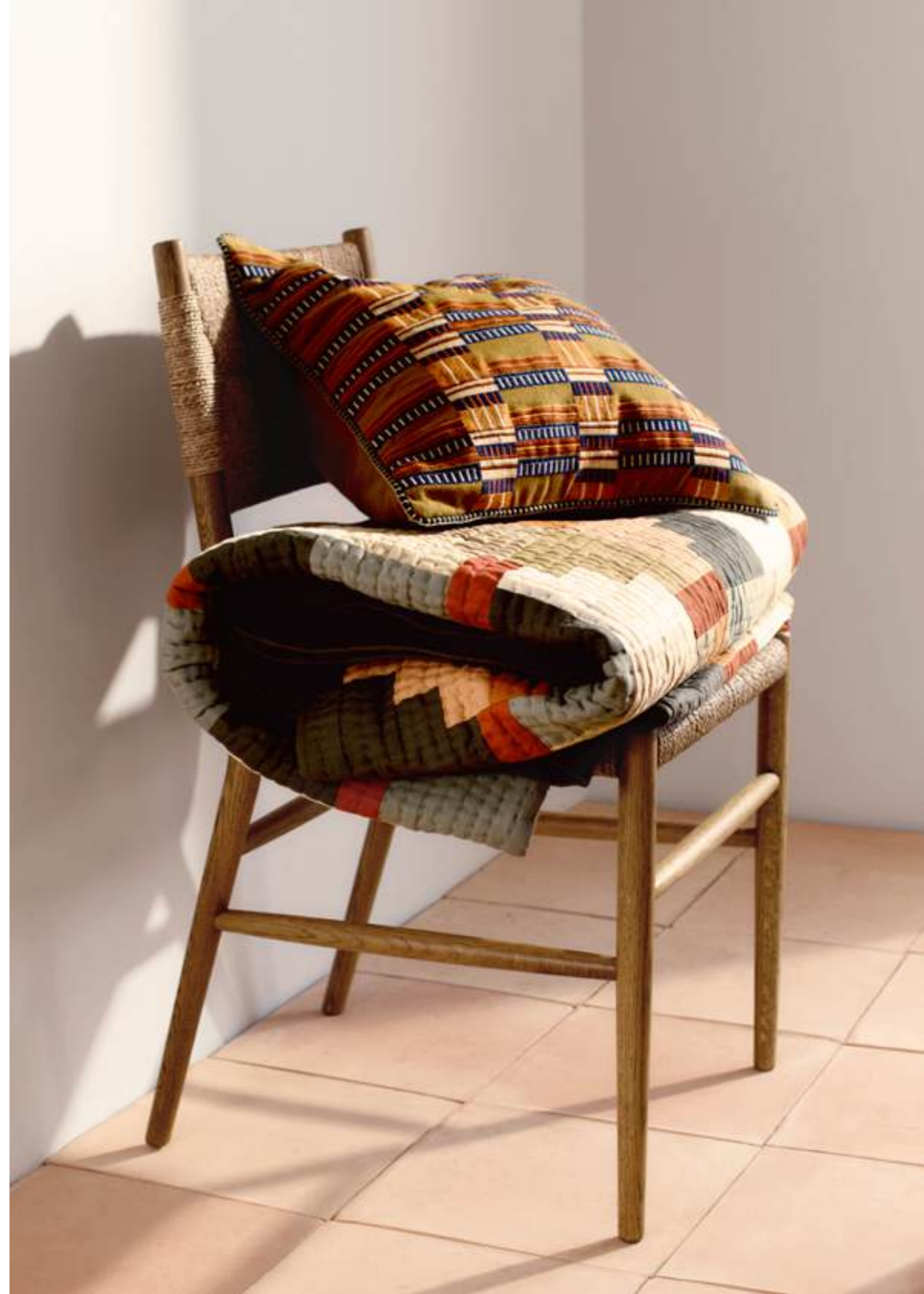
RIGHT: John Lewis Willow Seagrass Woven Chair, Oak, £199 / Leon Bedspread, £180 / Palenque Cushion, Bronze Green, £50