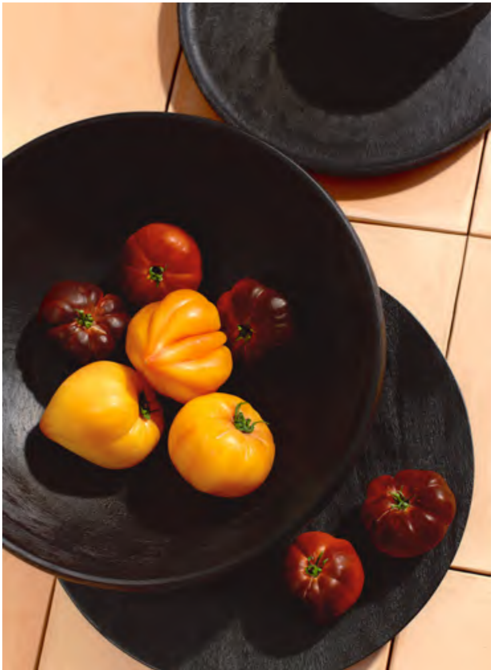
ABOVE: John Lewis Rustic FSC Mango Wood serve bowl, 38cm, Black, £55 / Platter, 35cm, £28 / Lazy Susan, 38cm, £45 / Bow, 15cm, £18