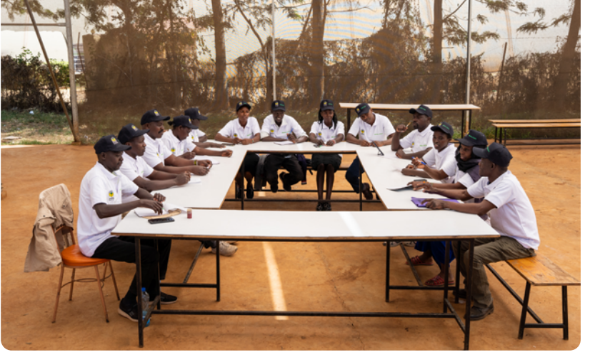
2. Due to the nature of our partnership in Ghana with the Blue Skies Foundation and Albert Heijn, the Waitrose Foundation does not Chair the steering group, but instead, we hold a membership position on the Blue Skies Foundation Board